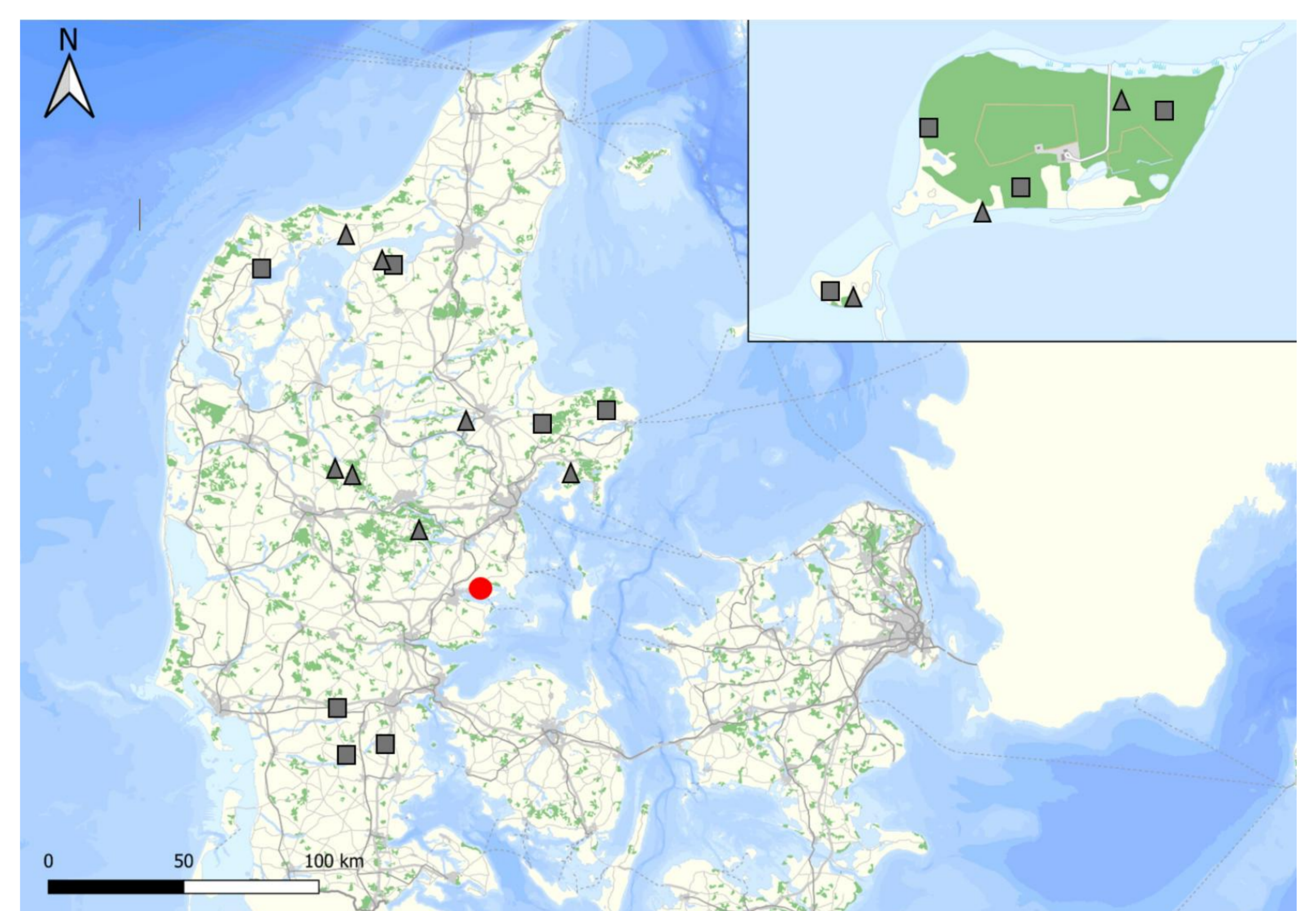
Figure 1. The figure indicates the areas where camera traps were placed at badger setts and along trails in Jutland, Denmark. Black triangles denote trail locations, while black squares denote sett locations. The red circle indicates the location of the inset map of Vorskø.

Two distinct habitats in Denmark: The undisturbed island of Vorskø and a highly human-impacted mainland of Jutland.