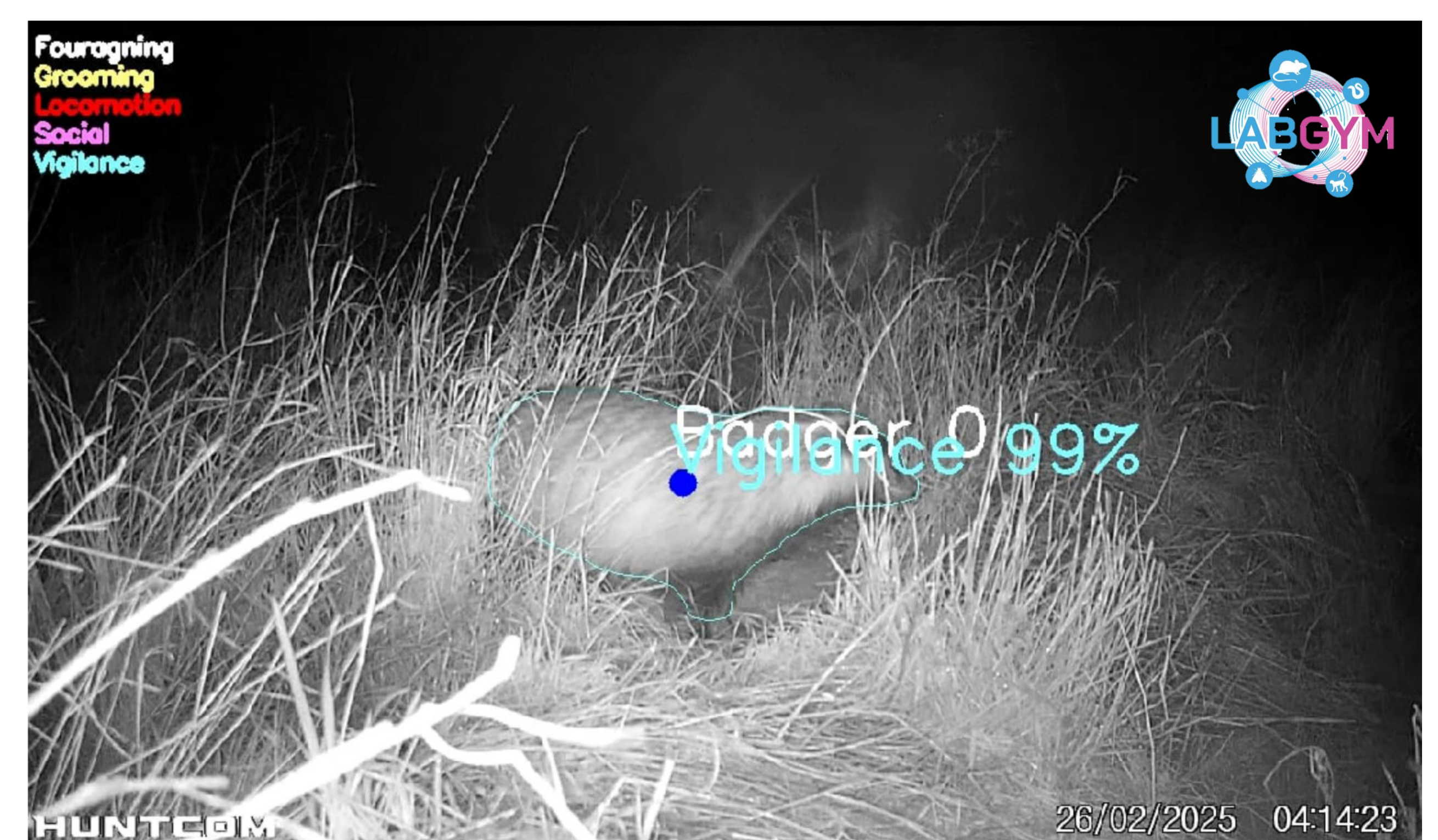
Figure 2. Badger behaviour on the mainland and island was quantified using LabGym (v2.5), a machine-learning tool for automated behavioural classification. Five predefined behaviours were classified: Foraging, Grooming, Locomotion, Vigilance, and Social behaviour, for approximately 2,000 videos. LabGym generated confidence scored classifications and exported timestamps, counts, and durations for each behaviour for later statistical analysis. The figure illustrates an example of LabGym categorising the behaviour Vigilance with 99% accuracy.